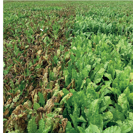
Left: Classic variety, Right: CERCOTECH® variety